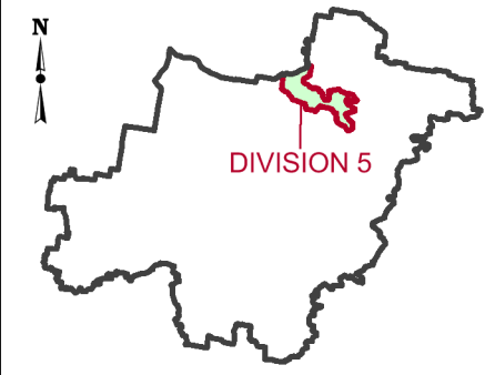
DIVISION 5 Location Map

DISCLAIMER While every care has been taken to ensure the accuracy of this product, the Electoral Commission Queensland (ECQ) makes no representations or warranties about its accuracy, reliability, completeness or suitability for any particular purpose and disclaims all responsibility and all liability (including, without limitation, liability in negligence) for all expenses, losses, damages (including indirect and consequential damage) and cost which might be incurred as a result of the data being inaccurate or incomplete in any way and for any reason.