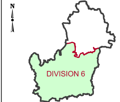
DIVISION 6 Location Map